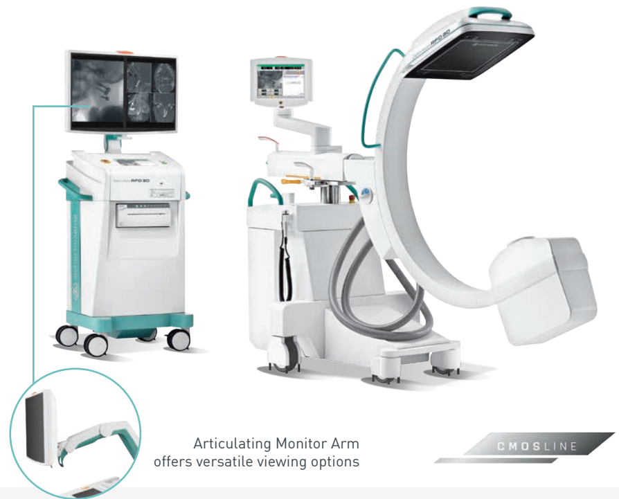
Articulating Monitor Arm offers versatile viewing options